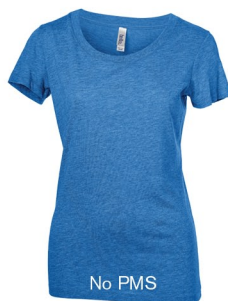
TRUE ROYAL TRIBLEND