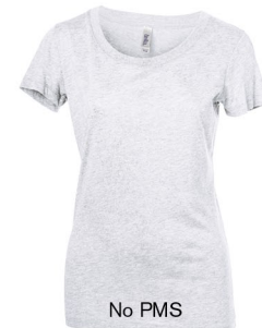
NEW! WHITE FLECK TRIBLEND