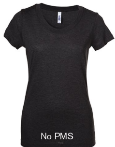
CHARCOAL BLACK TRIBLEND

Textile fabric colours are subject to dye lot variation and will not be exact match to print pantone reference