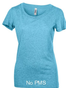
NEW! AQUA TRIBLEND