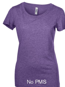
NEW! PURPLE TRIBLEND