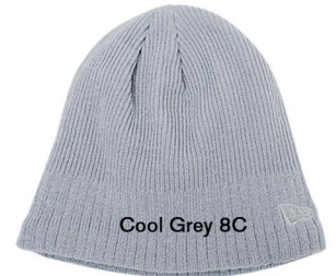
Cool Grey 8C