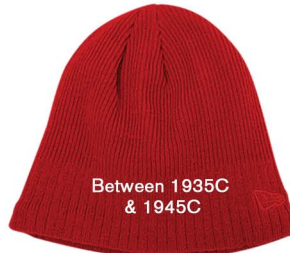
Between 1935C & 1945C