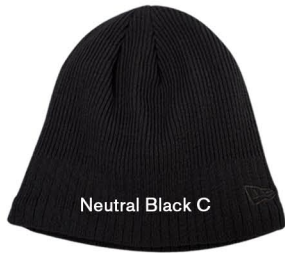
Neutral Black C