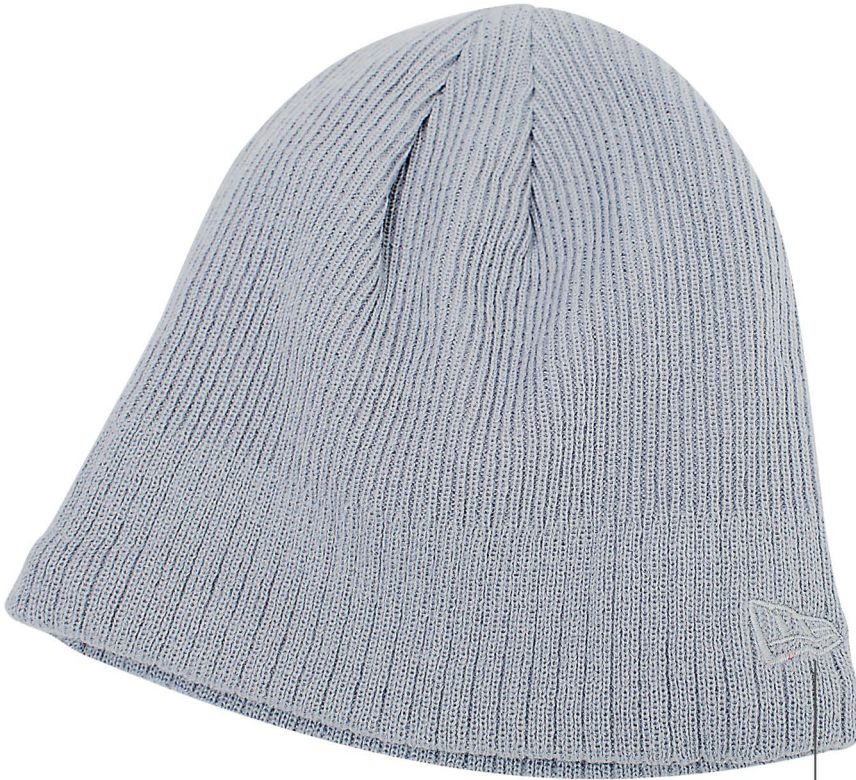
NEW ERA® tonal flag